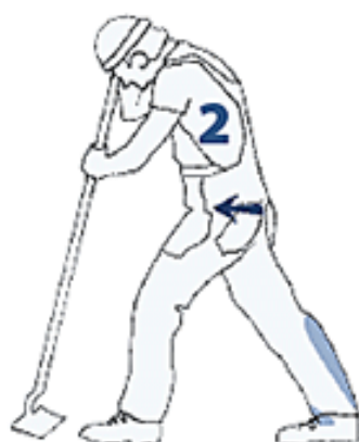
10–15 seconds each leg (page 71)