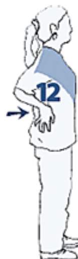
8–10 seconds 2 times (page 46)