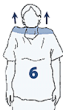
3–5 seconds 2 times (page 46)