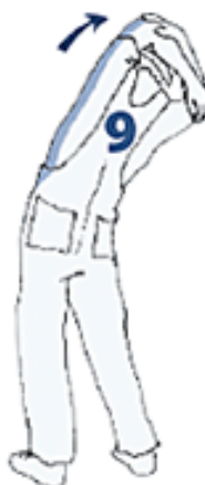
8–10 seconds each side (page 44)