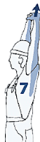
10–15 seconds (page 46)