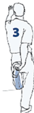
10 seconds each leg (page 75)