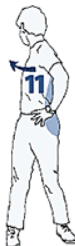
8–10 seconds each side (page 81)