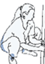
10 seconds (page 66)