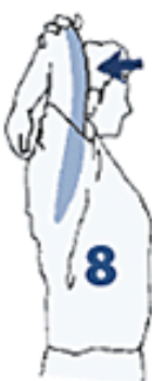
10 seconds each arm (page 44)