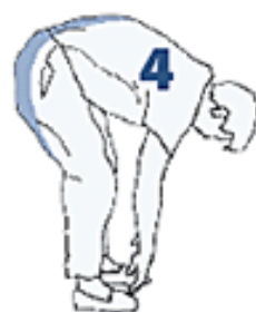
10–15 seconds (page 54)