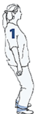
10–15 seconds (page 55)

Before you do any work in the garden, do a few minutes of easy stretching. This will help get your body ready to work efficiently without the usual tightness and stiffness that results from this kind of work. Stretch to reduce muscle tension and make work easier.